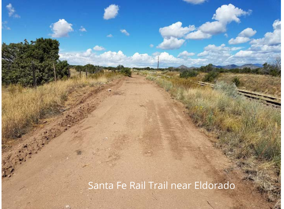
Santa Fe Rail Trail near Eldorado

Santa Fe County Open Space and Trails Program applied for and received Transportation Alternative Grant Funds for the Santa Fe Rail Trail and the Arroyo Hondo Trail in 2019. This grant amount includes approximately $500,000 for completion of Santa Fe Rail Trail Segment 6 (from Avenida Eldorado to Spur Ranch Road). This segment is currently under construction with plans to open in 2020.