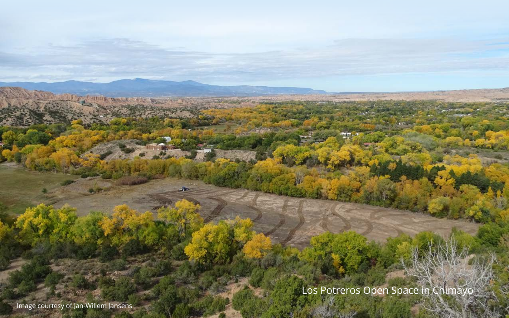
Los Potreros Open Space in Chimayo

This project was an incredible success! In the spring of 2019, approximately 90% of the planted area had plant cover from the seed mix. To follow up on this achievement, a phase II project commenced in the fall of 2019. This second phase was intended to enhance the water conveyance through the ditches through the upper potrero and completing up on a second series of seed planting for additional soil enhancement.