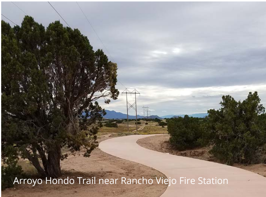
Arroyo Hondo Trail near Rancho Viejo Fire Station

Approximately $3.8 million was granted for segments 2, 3 and 4 of the Arroyo Hondo Trail. The first segment under construction starts at the Rancho Viejo Fire Station and connects to La Pradera Trails and to the Diverging Diamond Interchange. The other two segments will connect the Arroyo Hondo Trail from the Santa Fe Community College to the Turquoise Trail.