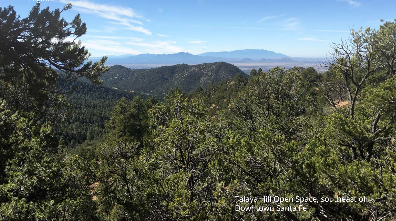
Talaya Hill Open Space, southeast of Downtown Santa Fe

This project has been highlighted by the North American Bird Conservation Initiative as a model project for wildlife conservation and fire hazard reduction initiatives in the Southwest region.